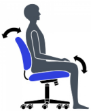
Chair Tilt Lock