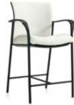
Counter and bar height stool with upholstered back

The design savvy Vion™ family is at home in any work environment, offering the broadest range of models and ergonomic features. There's a Vion for everyone. Multiple back heights, two seat widths, five mechanisms, mesh or upholstered backs and heavy duty models maximize choice. With the inclusion of height adjustable stools, guest seating, counter and bar height stools, Vion becomes an excellent choice for workplace, education and healthcare environments.