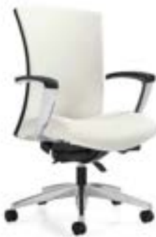
Meeting chair with upholstered back