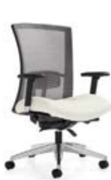
Work chair with mesh back