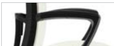
Optional fixed arm available for management and conference applications