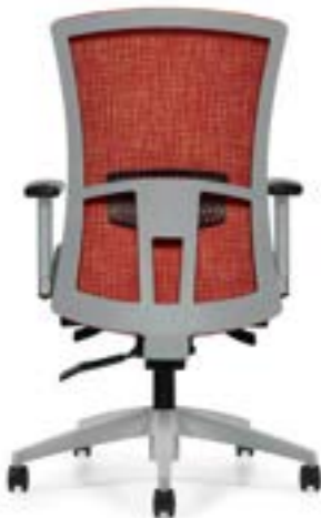
Fog frame and base