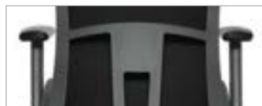
Frame available in Black or optional Fog and Shadow (shown)