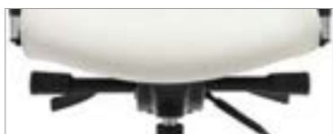
Synchro-tilter with back angle adjustment