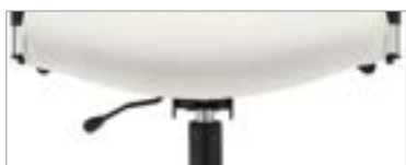
Task (swivel only)