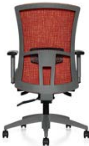
Shadow frame and base