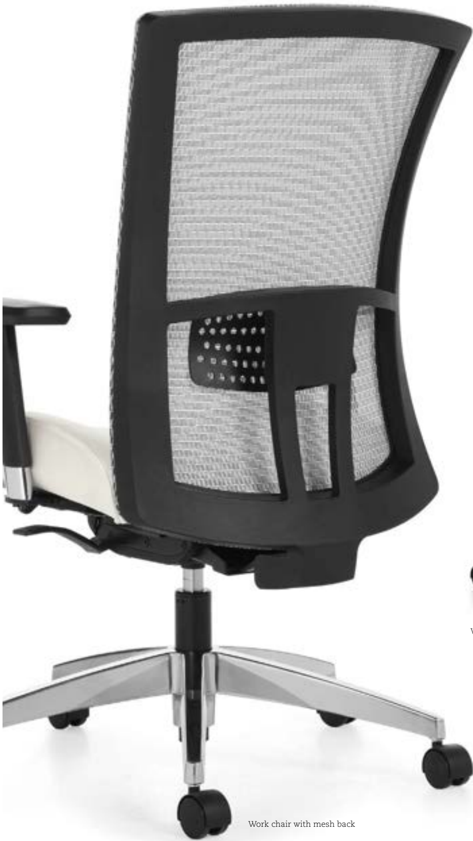
Work chair with mesh back