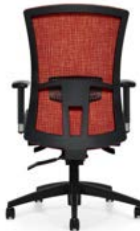
Black frame and base

Please visit globalfurnituregroup.com for additional product information including industry and environmental certifications.