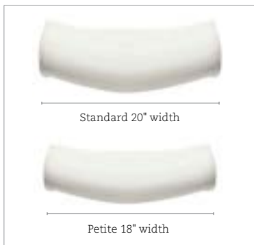
Petite seat option