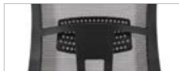
Optional Black lumbar pad provides 3" of adjustment