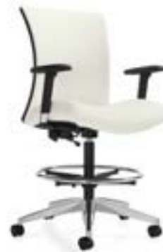
Height adjustable stool with upholstered back