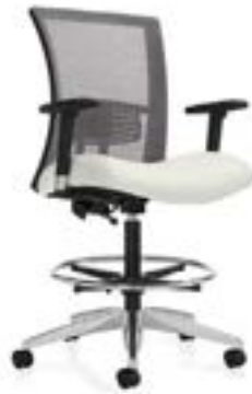
Height adjustable stool with mesh back