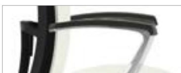
Polished aluminum fixed arm available