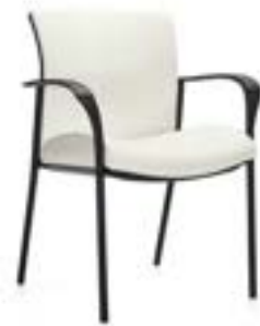
Guest chair with upholstered back