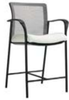
Counter and bar height stool with mesh back