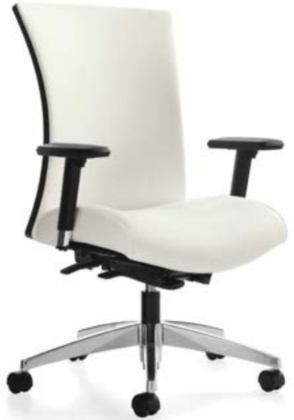
Work chair with upholstered back

Seating shown in Ultraleather, Ermine with polished aluminum base. Vion Mesh back shown in Natural.