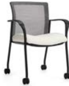
Guest chair with mesh back and casters