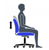
Back/Lumbar Height Adjustment