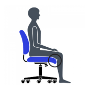
Waterfall Seat Edge