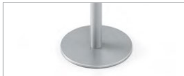
TTFD Flat disk column base