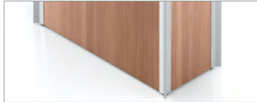
TELBR Rectangular base with rectangular anodized aluminum corner