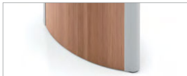
LEL Elliptical base with ribbed aluminum (BA) or PVC (B) ends