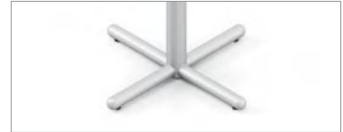
LL4S 4-star table leg with bullnose end