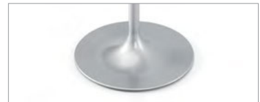
TRUM Trumpet column base