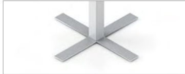
TTFLT Flat bar "X" column base