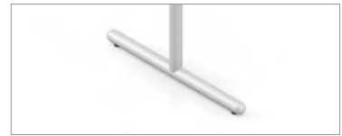
LLT "T" Table leg with bullnose end