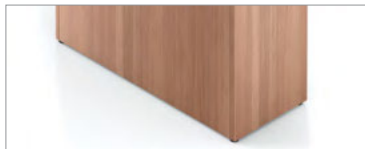
LR Rectangular laminate base