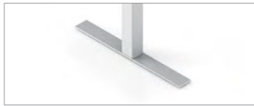
TTFLT Flat bar "T" column base