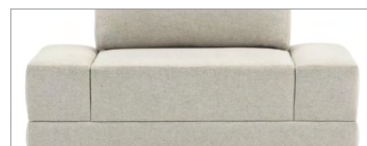
Standard seat cushion with two seams